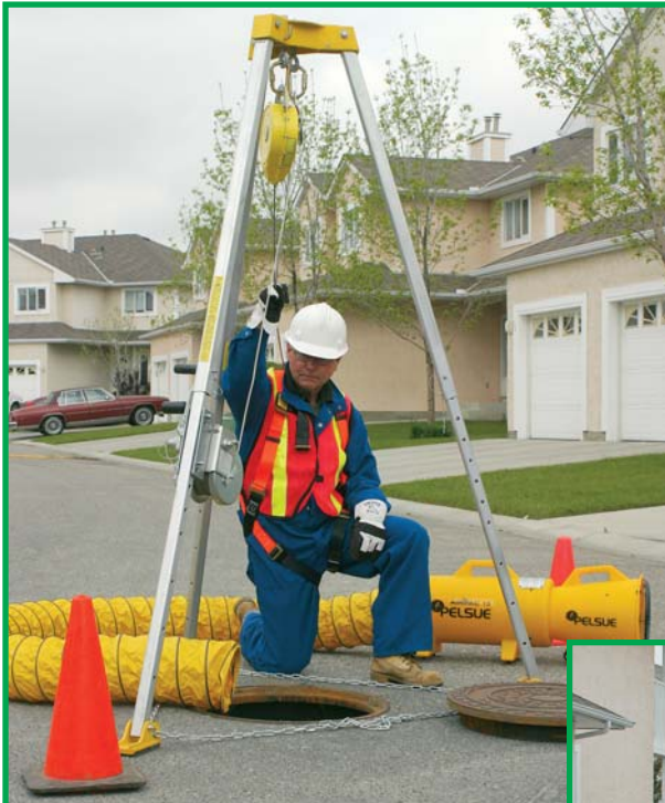
(Left) - PELSUE P700 Industrial Tripod (Product #7020) and Retrieval Kit (Product # 7021)

The P700 is a portable, lightweight, high-strength anchor. The locking legs can be adjusted to set the tripod at heights from 4-7'. Available with 30' self-retracting lifeline, cable, pulley, steel carabiner and man rated winch with 50' stainless steel cable.